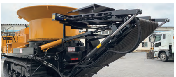
Foldable Belt conveyor

Improved discharge conveyor speed increases crushing