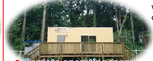
Remote operating room

Comfortable operating room for meeting, demo view and monitoring